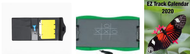
Figure 1: Three pictures: Braille Datebook 2020, Tactile Doodle, and EZ Track Calendar 2020