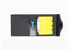
Figure 2 Picture of Braille Datebook 2020